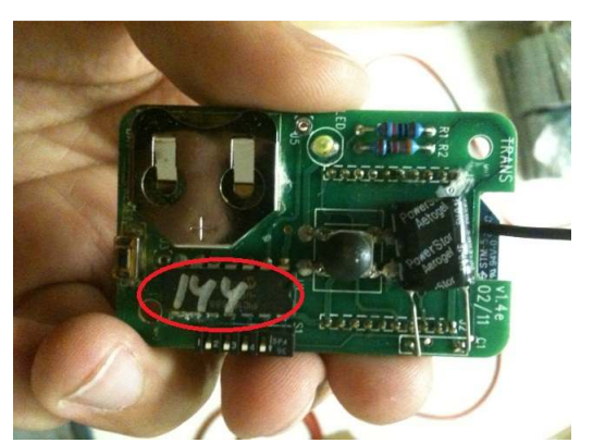
Remote Control 1.4.4

Sometimes a customer will be at a location where there is another radio transmitting device very nearby that will interfere with the remote control and receiver. Changing the code for the remote control and receiver will have no effect in a situation like this. Changing the frequency does not guarantee a clear radio channel immediately or indefinitely, but it can be a good option when there are no other possible solutions. There are 16 alternate frequencies available. The frequency selection must match on the receiver and on the remote.